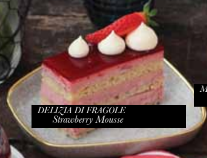
DELIZIA DI FRAGOLE Strawberry Mousse