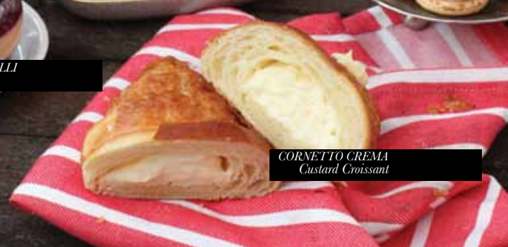
CORNETTO CREMA Custard Croissant