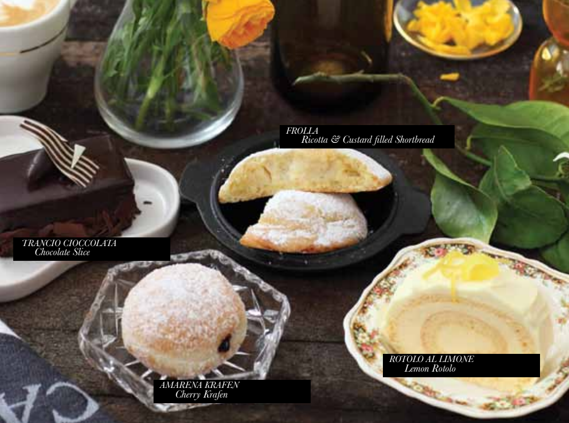
FROLLA Ricotta & Custard filled Shortbread