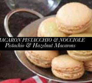
MACARON PISTACCHIO & NOCCIOLE Pistachio & Hazelnut Macarons